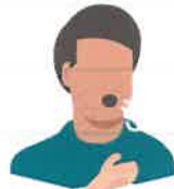
Shortness of breath or problem breathing